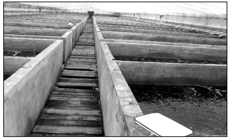
Figure 2. Larval rearing facility.

Growout systems are considered extensive, semi-intensive or inten-