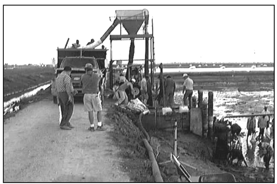
Figure 3. Shrimp harvester.

Inland farming of marine shrimp, using brackish water, is being done successfully on a commercial scale in Texas, Alabama and Arizona; however, specific water quality parameters of saline groundwater are of extreme importance in the selection of successful sites. Florida is also attempting the commercial culture of marine shrimp using "fresher" ground waters. The brackish water operations have operated successfully for several years and expanded. In Arizona, extremely low salinity effluents from ponds are used in integrated systems as a rich source of water for irrigating winter wheat and table olives. Saline effluent in other states is used in either on-site hold-