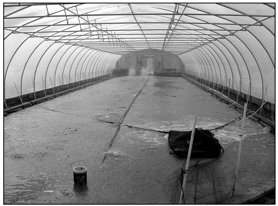
Figure 4. Super-intensive raceway system for shrimp.

ing ponds or reused in adjacent catfish ponds. In inland systems, saline effluent will remain a major issue as more restrictions on aquaculture effluent evolve.